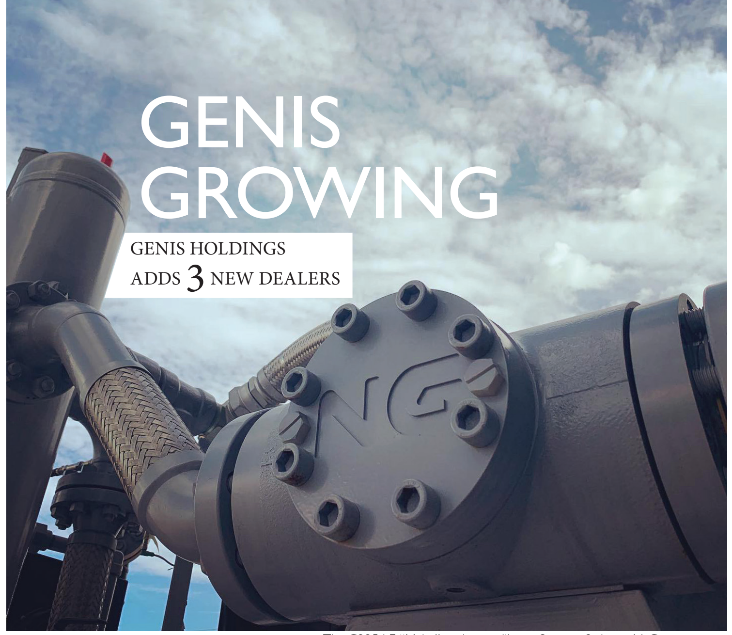
The G225 LE "Mako" package utilizes a 3-stage, 2-throw N-G compressor.